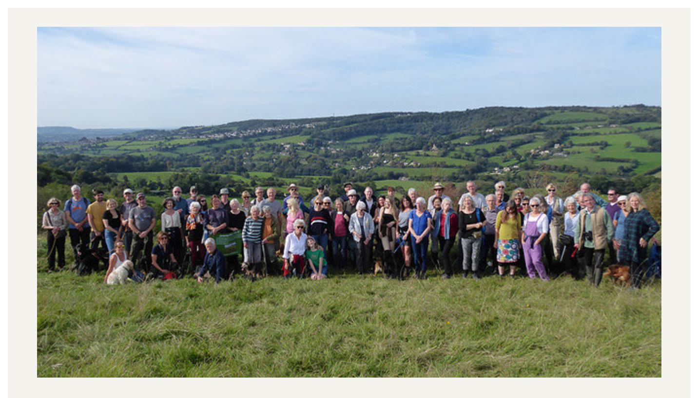
Photo of the 8th October walk on Juniper Hill Field in support of the campaign