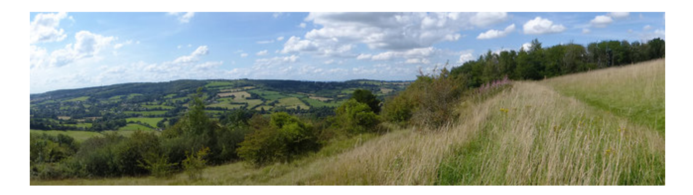
Panorama shot from Juniper Hill Field showing its proximity to the Painswick Valley.